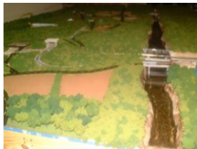
COUNTY MODEL RAILROAD

THE MACON COUNTY HISTORICAL MUSEUM IS A NONPROFIT EDUCATIONAL ASSOCIATION THAT COLLECTS, PRESERVES AND INTERPRETS THE HISTORY OF MACON COUNTY, GEORGIA.