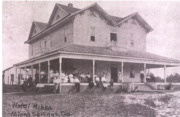
Miona Springs Hotel famed for flavored mineral springs

NORFOLK SOUTHERN RAILROAD GAVE THE MONTEZUMA DEPOT TO THE MACON COUNTY HISTORICAL SOCIETY IN 1980. THE NATIONALLY REGISTERED STRUCTURE WAS REHABILITATED IN 2002 AND NOW SERVES AS THE MACON COUNTY HISTORICAL MUSEUM. THE MUSEUM PRESERVES AND MAINTAINS MEMORIES OF THE EVENTS AND PEOPLE THAT SHAPED MACON COUNTY.