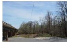
George Hooks Boat Landing