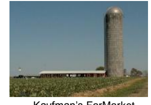
Kaufman's FarMarket Strawberries & Silo Cafe