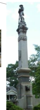
Carmichael Park Confederate Monument