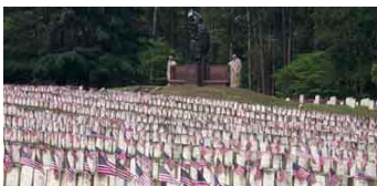
Andersonville National Historic Site & POW Museum