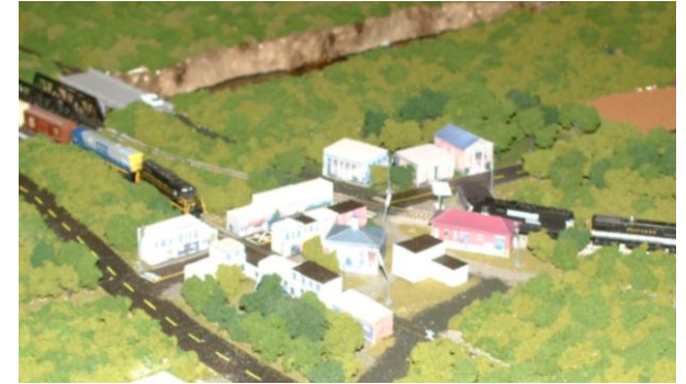
RAILROAD DIORAMA OF MONTEZUMA IN MUSEUM