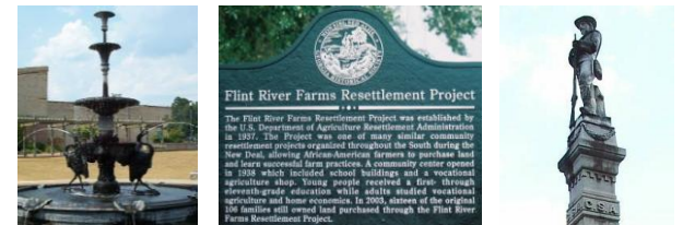
MEMORIAL PARKS & HISTORIC MONUMENTS