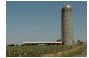
Kaufman's FarMarket Strawberries & Silo Cafe