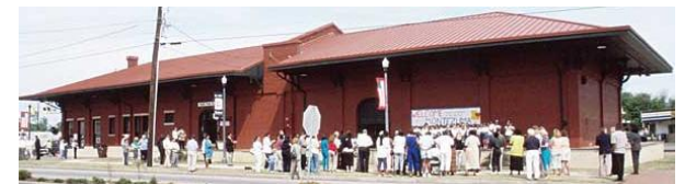
MONTEZUMA RAILROAD DEPOT & HISTORICAL MUSEUM