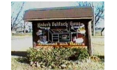
Yoder's Deitsch Haus Restaurant, Bakery & Gift Shop