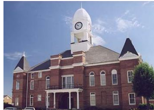
Macon County Courthouse