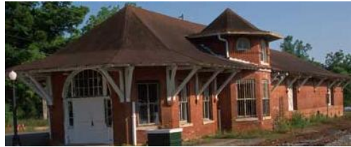
Rosati's Depot & Locomotive Cafe