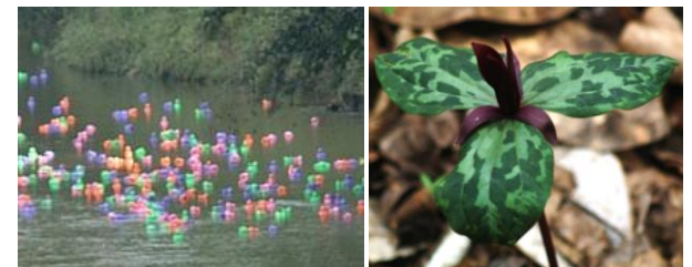
BEAVER CREEK DUCK RACE