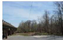
George Hooks Boat Landing