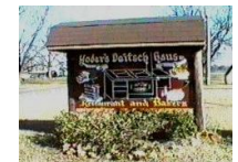
Yoder's Deitsch Haus Restaurant, Bakery & Gift Shop