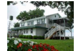
Whitehouse Farm Bed & Breakfast