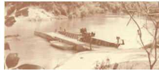
Site of Georgia's Last River Ferry