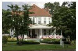
Traveler's Rest Bed & Breakfast