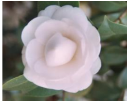
Massee Lane Camellia Gardens