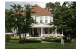
Traveler's Rest Bed & Breakfast