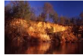
Montezuma Bluff Wildlife Management Area & Crooks Boat Landing