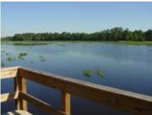
Whitewater Creek Park & Campground