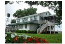
Whitehouse Farm Bed & Breakfast