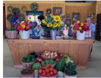
Brown's Farm Market & U-pick Flowers