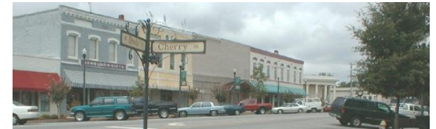
NATIONAL HISTORIC REGISTER: DOWNTOWN MONTEZUMA