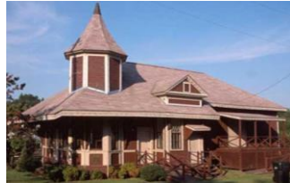
Ideal Depot & Community Center